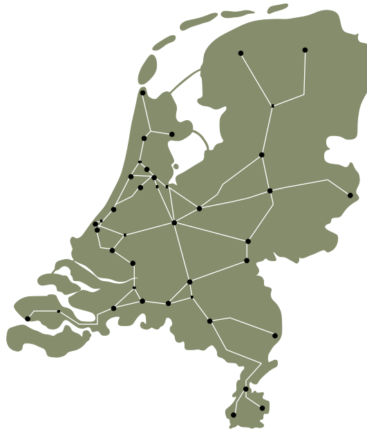
Figure 2: Dutch railway network